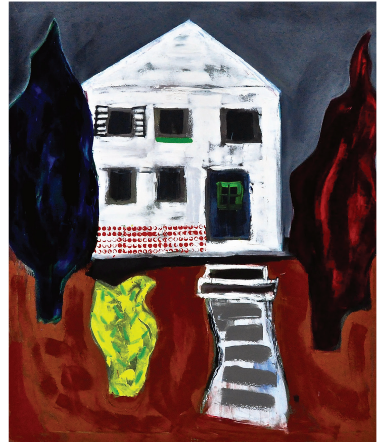
Brenda Giegerich Inside Outside (2017) 60" x 48"

Sandra Gottlieb's haunting and hypnotic photographic studies of clouds seem to bring all the powers of nature into one single moment. The fiery forms filled with volcanic moisture pose many thoughts of a climate gone awry, while the majesty of the shapes and the sheer volume captured cannot be fully grasped in practical terms. Some suggest we should look to the sky, to the heavens for answers, yet the information we seek can bring concern or doubt about our planet's future. So we look up and take in a sunset, a sunrise or a pristine blue sky and wish, or better yet, insist that this must never end.