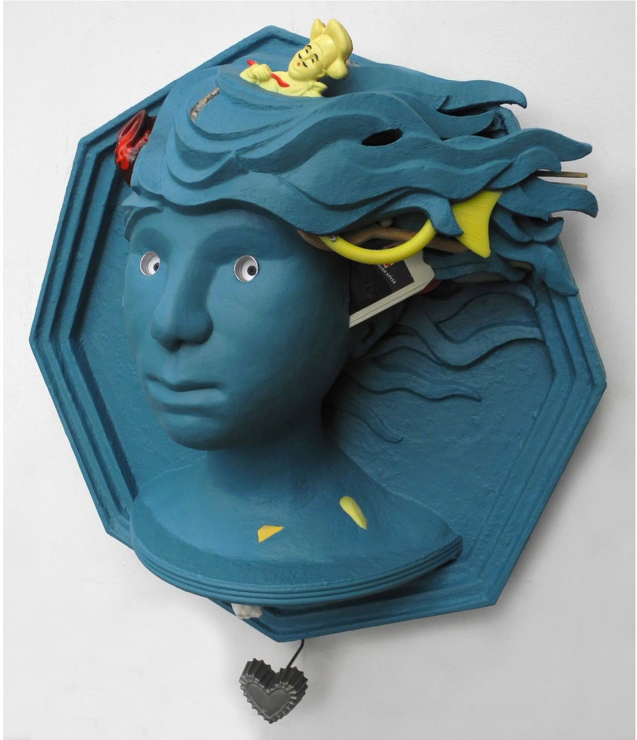
D. Dominick Lombardi Saint Lucy (Santa Lucia) (2016) acrylic paint, acrylic medium, gesso, paper mâché, found objects, salvaged wood, screws 29 inches x 25 inches x 8 inches