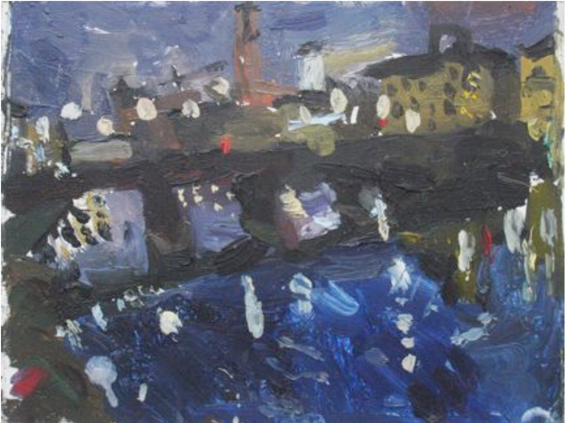
Florence, Sta. Trinita, 1998 Oil on panel, 6" x 8"

500 W Cermak Rd #727, Chicago, IL 60616 • www.peregrineprogram.com • 312.451.1780 ed@peregrineprogram.com