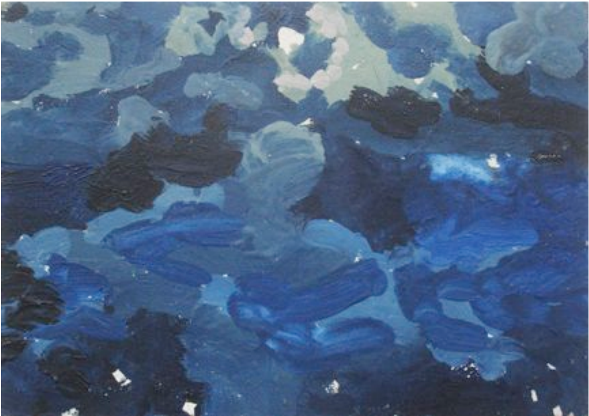
Moon Over Stars, 1999 Oil on panel, 3½" x 5"

500 W Cermak Rd #727, Chicago, IL 60616 • www.peregrineprogram.com • 312.451.1780 ed@peregrineprogram.com