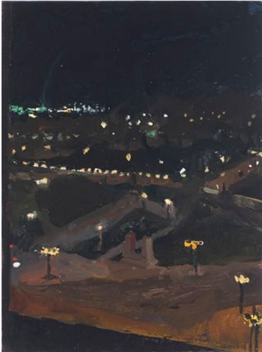
Grant Park 3/25/10, 2010 Oil on panel, 8" x 6"

500 W Cermak Rd #727, Chicago, IL 60616 • www.peregrineprogram.com • 312.451.1780 ed@peregrineprogram.com