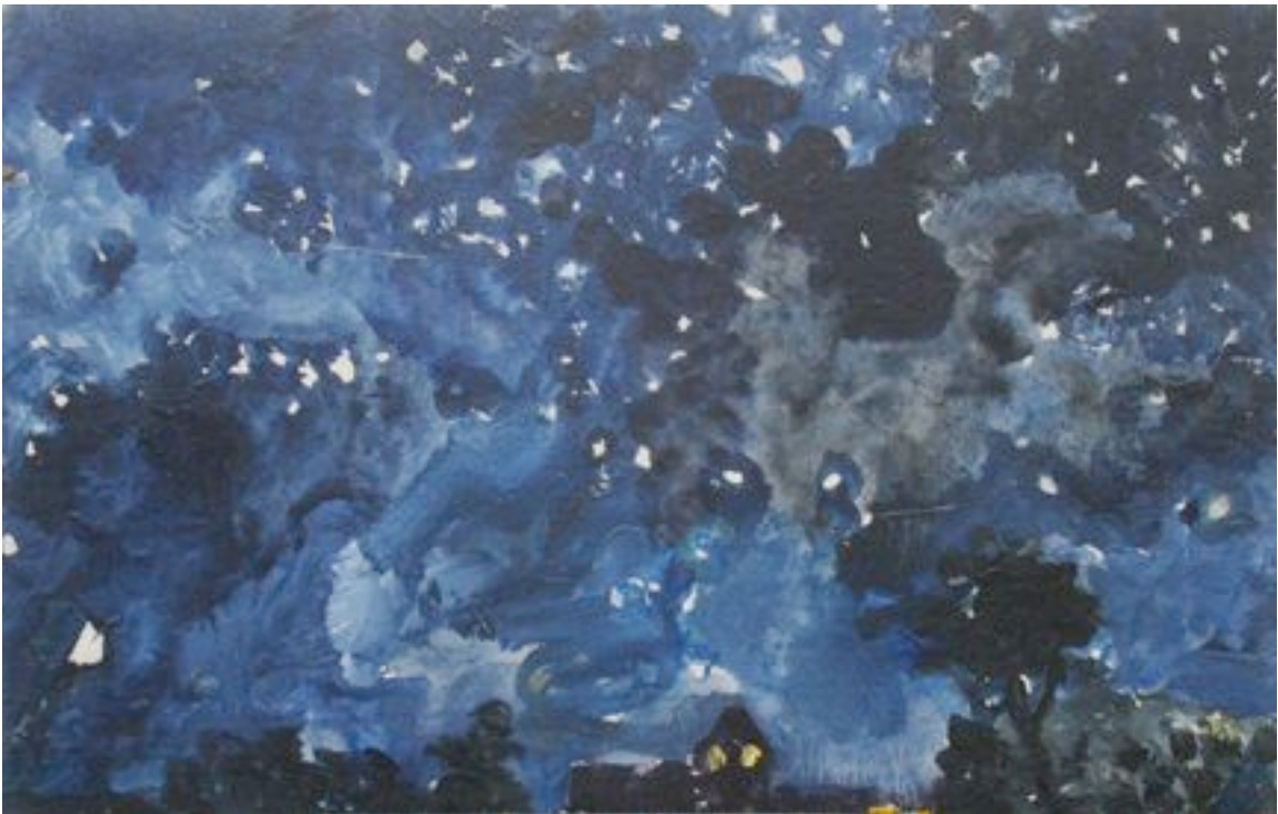
Main Street Moon, Johnson Vermont, 2000 Oil on panel, 5" x 8"

500 W Cermak Rd #727, Chicago, IL 60616 • www.peregrineprogram.com • 312.451.1780 ed@peregrineprogram.com