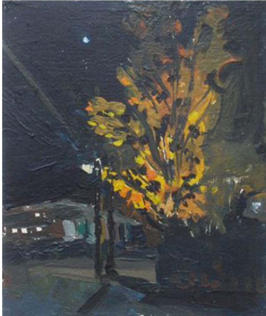
Pearl Street, Kahn Studio, 2006 Oil on panel, 6" x 5"

500 W Cermak Rd #727, Chicago, IL 60616 • www.peregrineprogram.com • 312.451.1780 ed@peregrineprogram.com