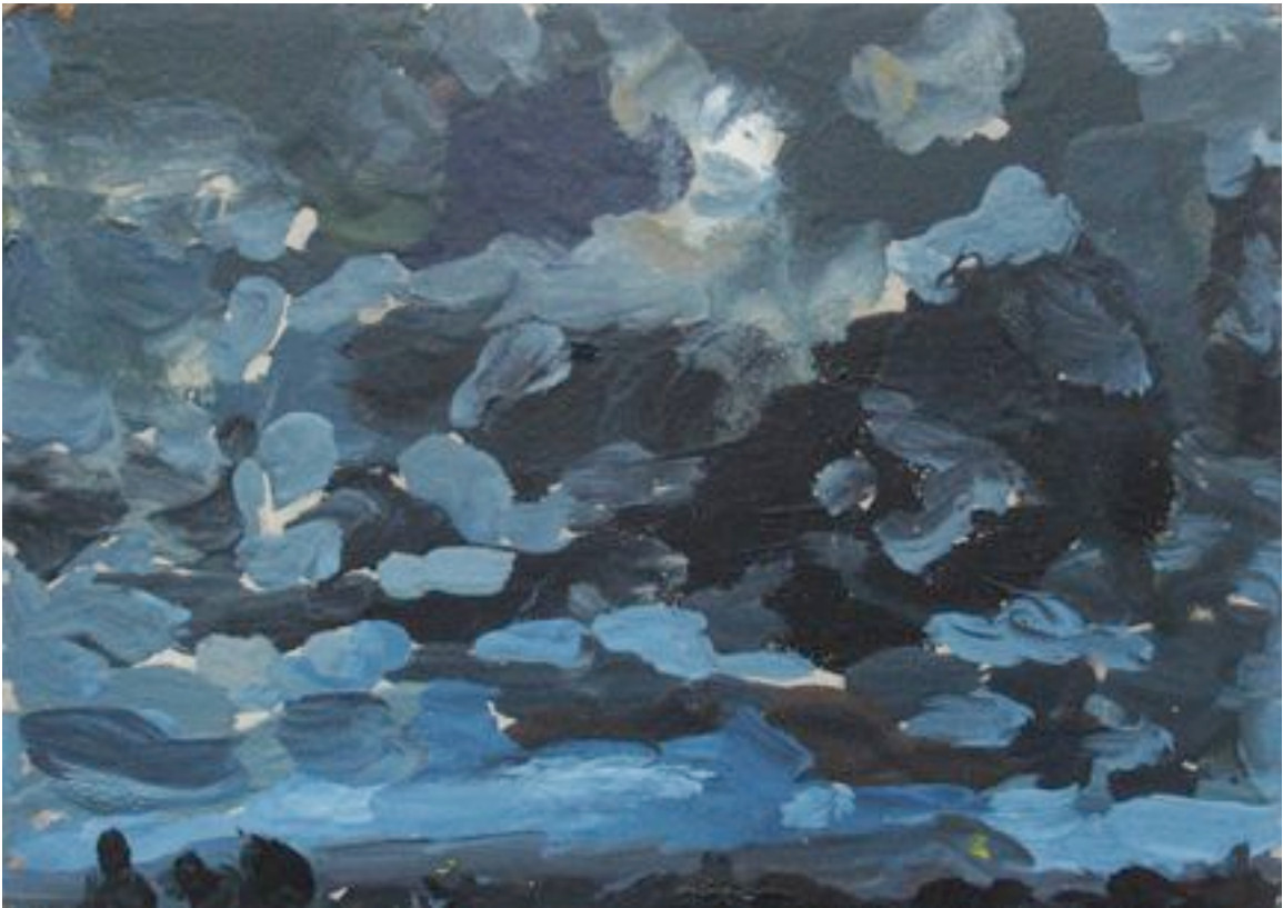
High Moon Over Mt. Mansfield, 1999 Oil on panel, 3½" x 5"

500 W Cermak Rd #727, Chicago, IL 60616 • www.peregrineprogram.com • 312.451.1780 ed@peregrineprogram.com