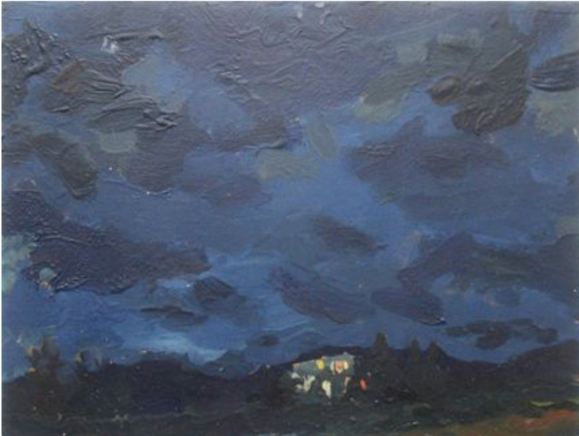
Nighthouse from Starfield, 2000 Oil on panel, 5" x 8"

500 W Cermak Rd #727, Chicago, IL 60616 • www.peregrineprogram.com • 312.451.1780 ed@peregrineprogram.com