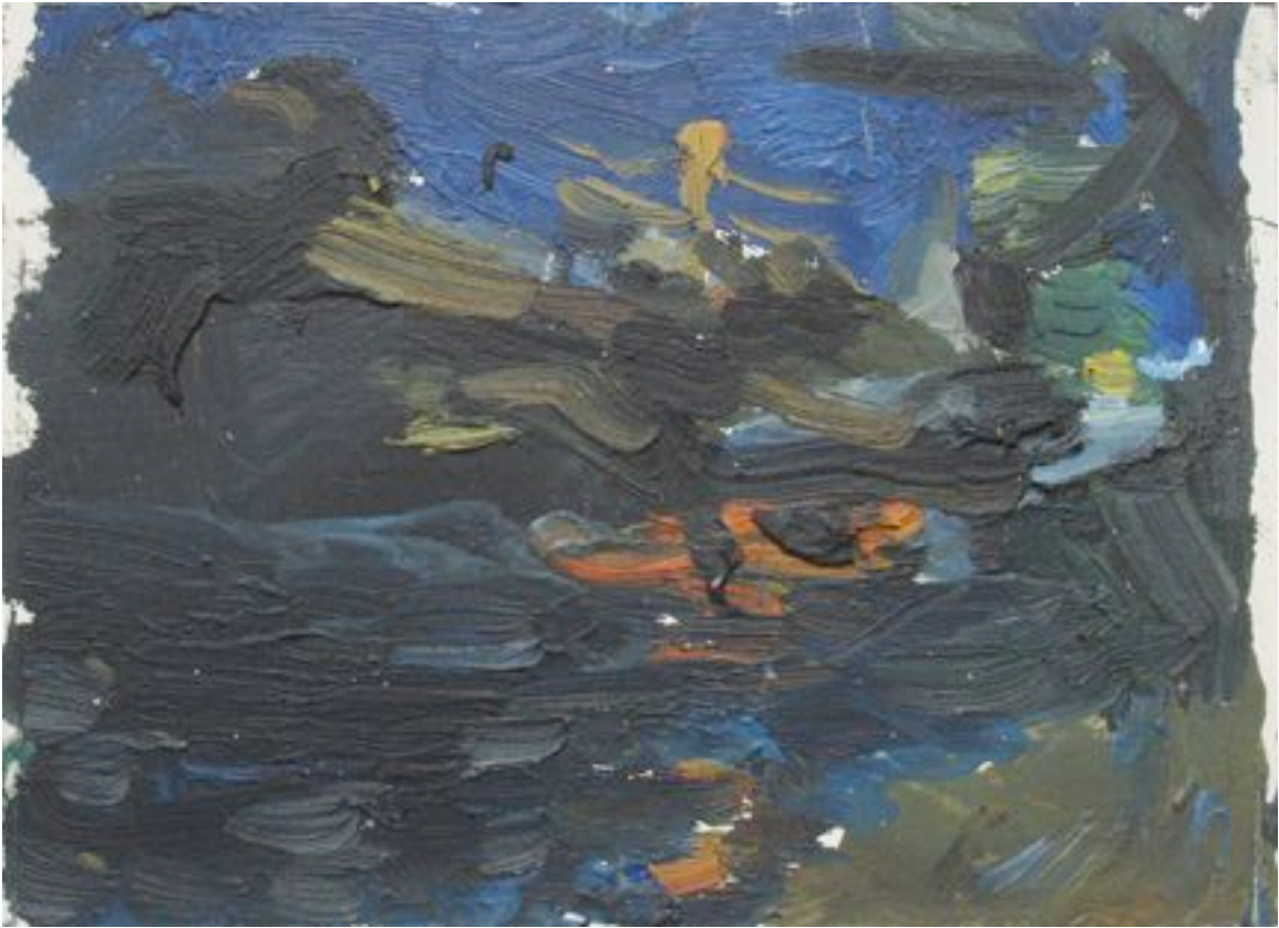
Falls, Pines, 1996 Oil on panel, 6" x 8"

500 W Cermak Rd #727, Chicago, IL 60616 • www.peregrineprogram.com • 312.451.1780 ed@peregrineprogram.com