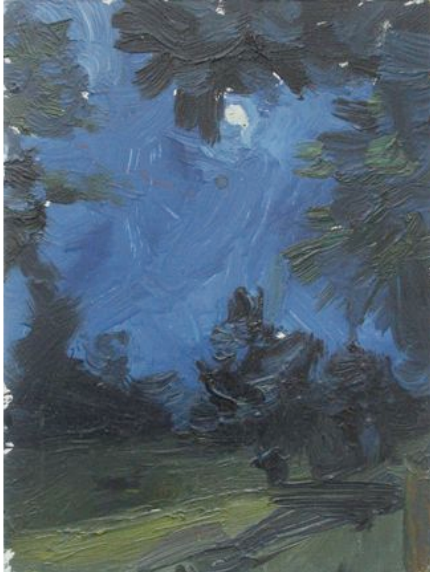
Clay Hill Road, 1995 Oil on panel, 8" x 6"

500 W Cermak Rd #727, Chicago, IL 60616 • www.peregrineprogram.com • 312.451.1780 ed@peregrineprogram.com