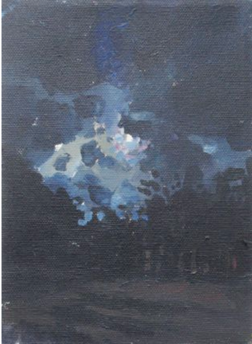
Skowhegan Upper Field, 2007 Oil on canvas, 7" x 5"

500 W Cermak Rd #727, Chicago, IL 60616 • www.peregrineprogram.com • 312.451.1780 ed@peregrineprogram.com