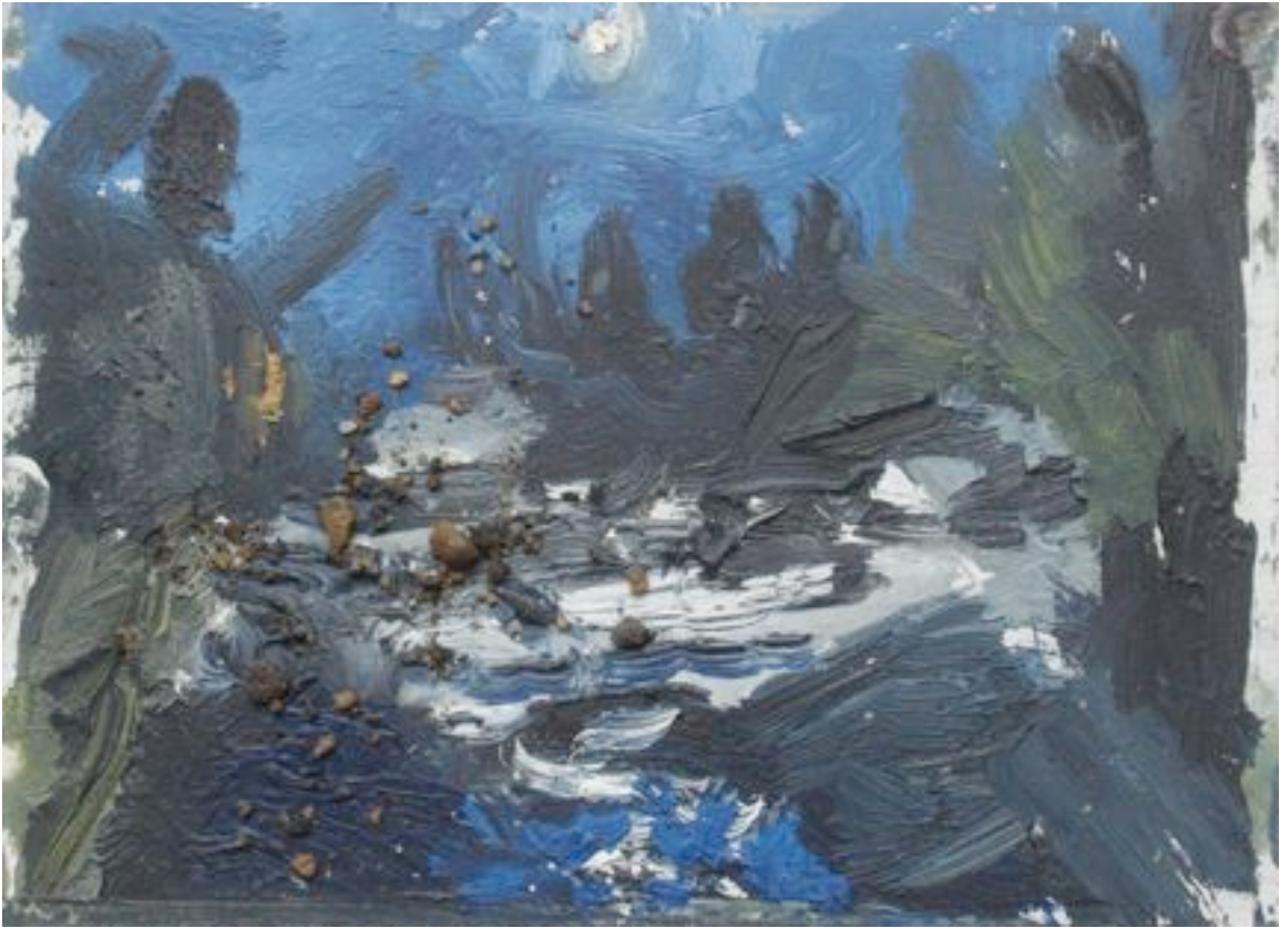
Pebbles, 2003 Oil on panel, 6" x 8"

500 W Cermak Rd #727, Chicago, IL 60616 • www.peregrineprogram.com • 312.451.1780 ed@peregrineprogram.com