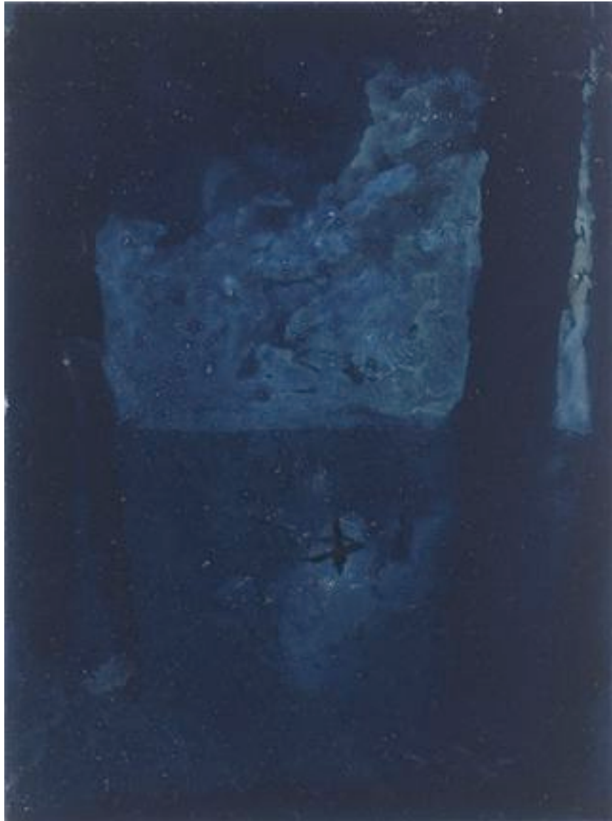
Skowhegan, 2010 Oil on panel, 8" x 6"

500 W Cermak Rd #727, Chicago, IL 60616 • www.peregrineprogram.com • 312.451.1780 ed@peregrineprogram.com