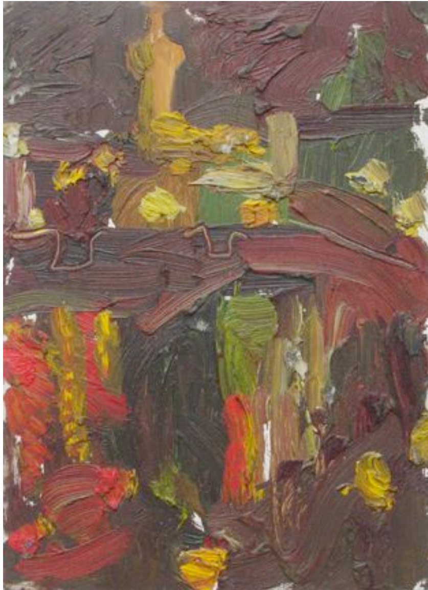
Chicago River, 2004 Oil on panel, 8" x 6"

500 W Cermak Rd #727, Chicago, IL 60616 • www.peregrineprogram.com • 312.451.1780 ed@peregrineprogram.com