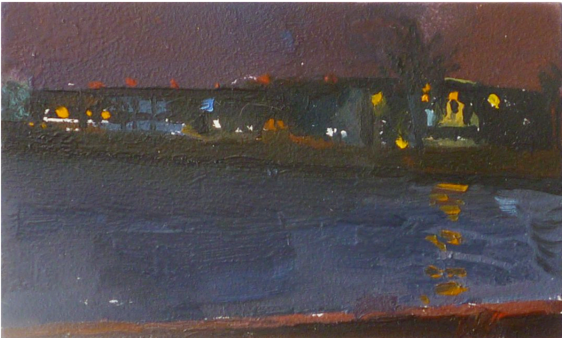
McCormick Place, April 2010, 2010 Oil on panel, 3" x 5"

500 W Cermak Rd #727, Chicago, IL 60616 • www.peregrineprogram.com • 312.451.1780 ed@peregrineprogram.com