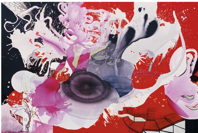
"Gaoxing, Beijing" 2009, acrylic on linen, 79" x 110" Courtesy Lesley Heller Workspace

http://www.artsforactfineartauction.com/index.html