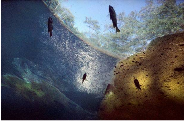
"Bream in the Highlights"

2006, pigment print on hahnemühle photo rag, 25" x 37"