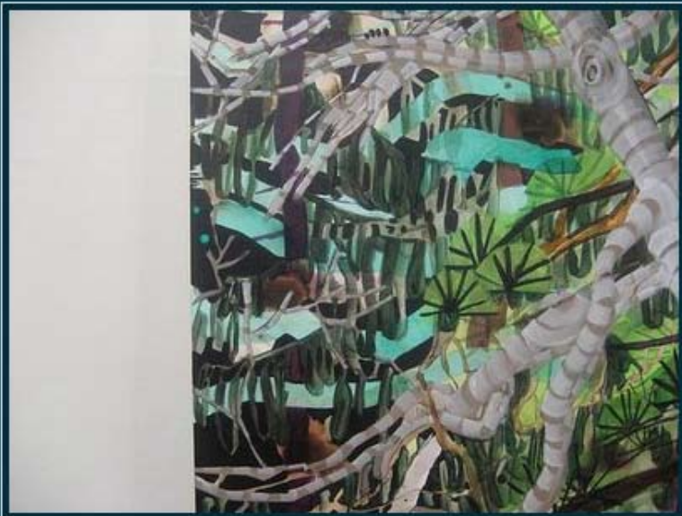
detail from top image. click here to see more studio photos.