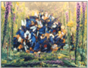
Image: Gregory Crewdson, Untitled , 1994, Courtesy Luhring Augustine Gallery

Contemporary artists working in a variety of media explore the idea of garden as paradise: perfect, sheltered, and lusciously beautiful botanic spaces. Sometimes there is a hint of darkness, a threat – like the snake in Eden. Or the beauty is tempered by the reality that many 21st century natural paradises are endangered areas. But the attraction of these lush, magnificent green spaces is powerful and undeniable.