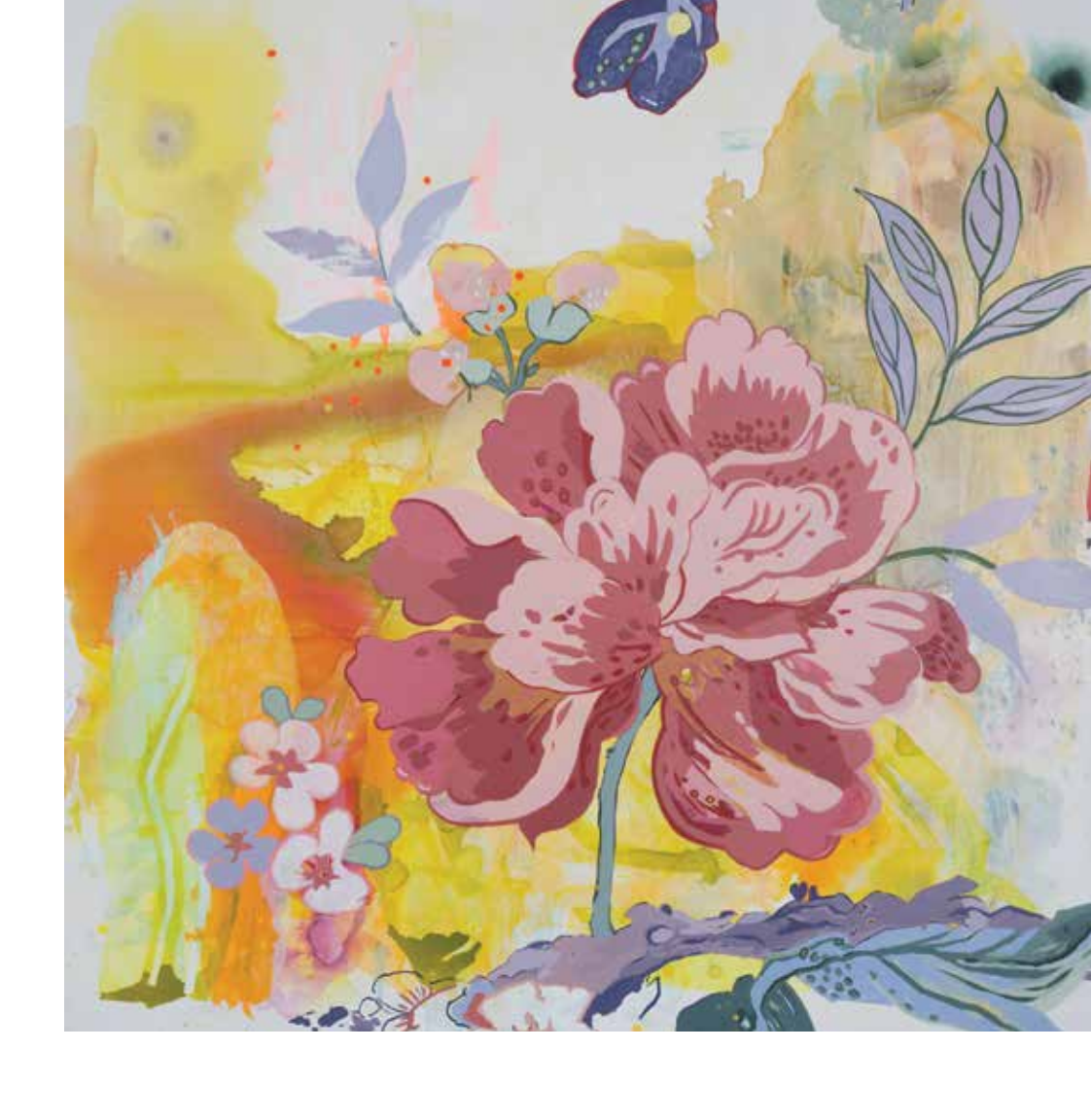
Urban Jungle 2015, Acrylic on linen, 59 x 59 inches