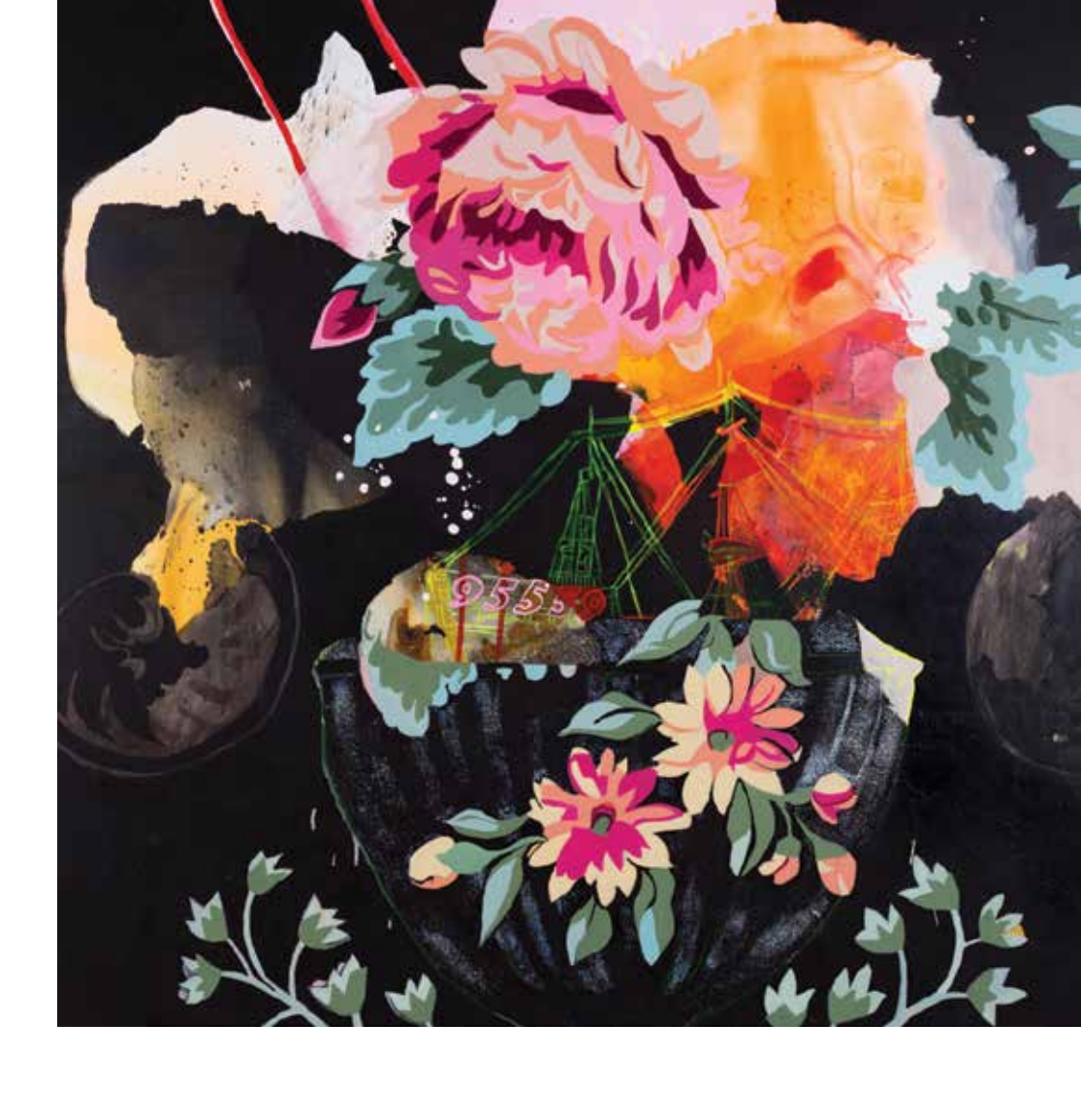
Bright Wing 2016, Glitter, ink, acrylic on linen, 28 x 25 inches