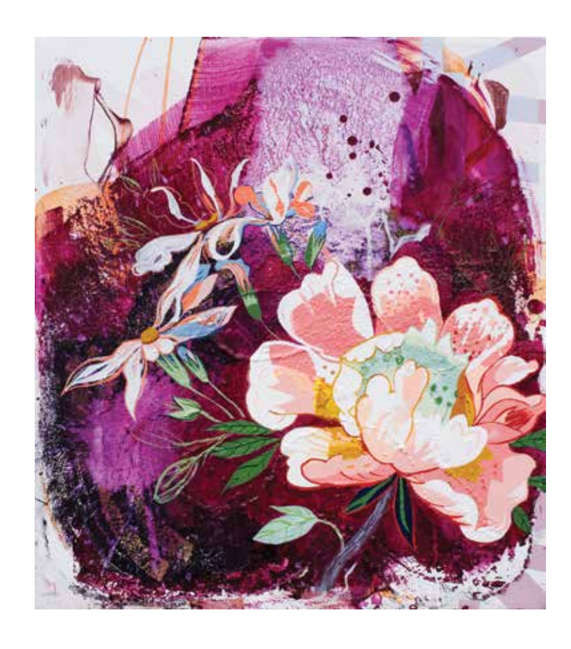
I'm Still With You 2016, Acrylic, glitter on linen, 48 x 48 inches