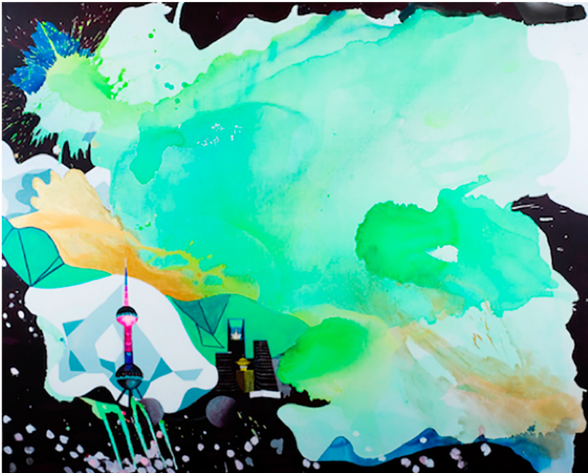
Electric LotusLand, Elisabeth Condon, 2014. 79 inches. Mixed media on canvas.