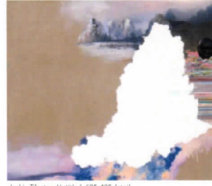
Jackie Tileston Untitled 60"x48" detail