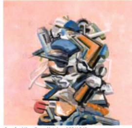
Stanford Kay Great Heights 30" X 24"