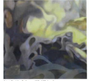
Cristi Rinklin Epilogue 48"x60" detail