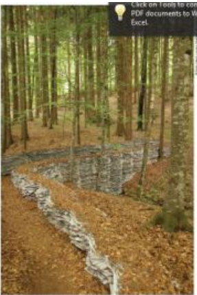
Stevens Savian, Bridge 2, Arts Falls , half paper, variable dimensions, 2009