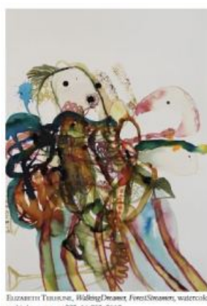
ELIZABETH TERLAKINE, Walking Dreamer Forest/Songster , watercolor and ink on paper, 22"x16.25", 2012