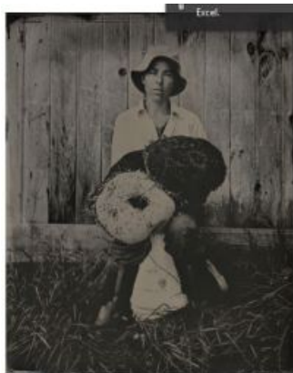
Chris J. Shuman, Money with Jagloves , wet plate collodion photograph, 9"x10", 2011