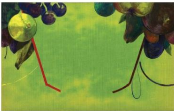
ERIK SCHOONHOVEK, Untitled (C-54) , gouache and acrylic on book cover, 5.4375" x 8.75", 2012 [from the collection of Monica Herman, courtesy Jeff Bailey Gallery]

Stone Canoe, Number 7 will be available for purchase at the Syracuse University Press website ( http://www.syracuseuniversitypress.syr.edu/subject/distributed-syracuse-university.html ). See the photographs below for a sneak peek inside the newest edition!