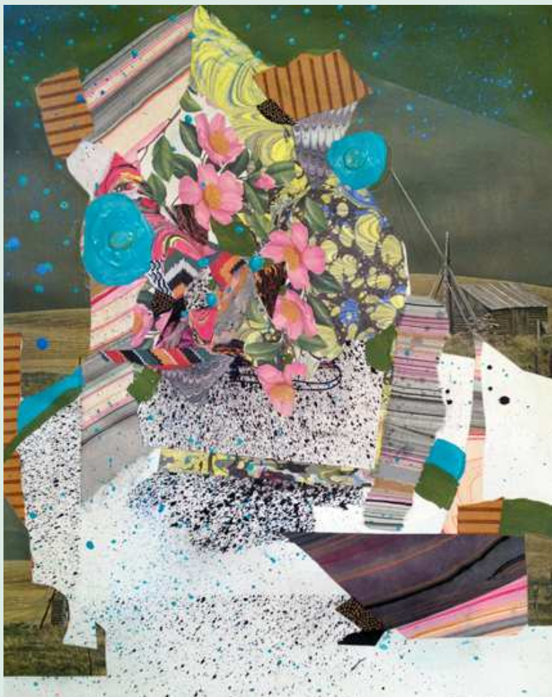
Land Escape 2012

more of the artist's work can be seen here