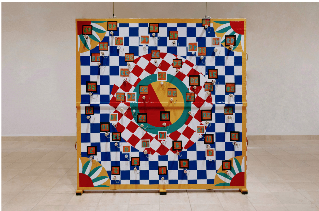
Carretto , Enamel on wood, rubber, metal, PVC, 72 x 72 x 6 in, 2020