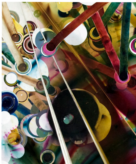
(detail) Firework Drawing #65 , Lit color smoke firework residue on paper, collage, 81 \frac{1}{2} x 65 \frac{1}{2} in, 2011