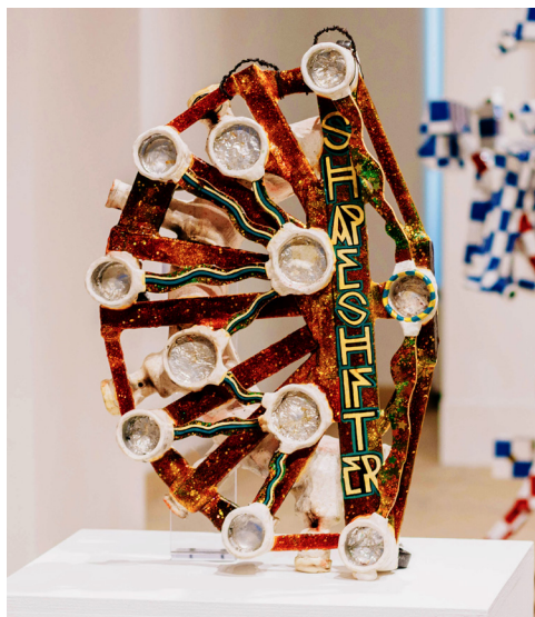
Shapeshifter , Smoke painting tool, wood, resin and mixed media, 22 x 16 x 5 in, 2014