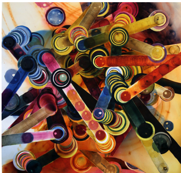
Smoke Painting #37 , Lit color smoke firework residue on paper, collage, 38 x 35 ½ in, 2013