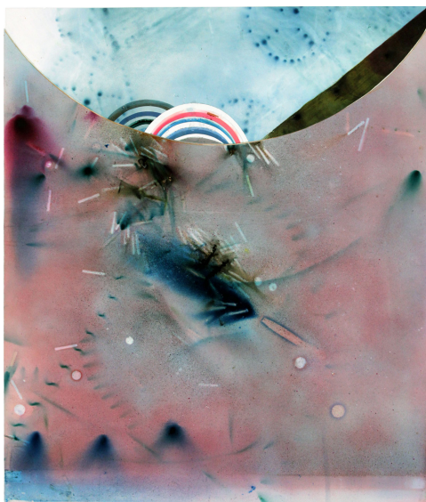
Smoke Painting #29 , Lit color smoke firework residue on paper, collage, 24 x 28 \frac{7}{8} in, 2013