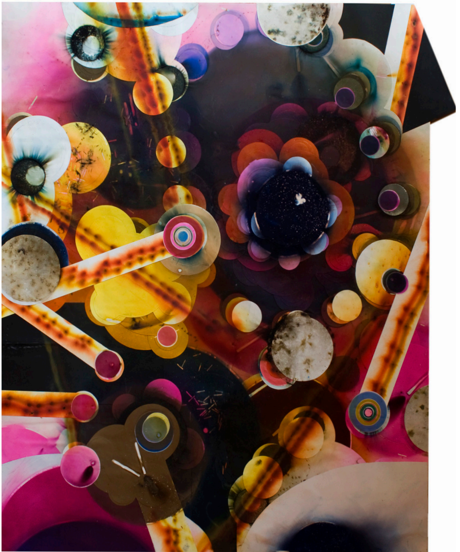
Firework Drawing #11 , Lit color smoke firework residue on paper, collage, 81 x 71 in, 2009