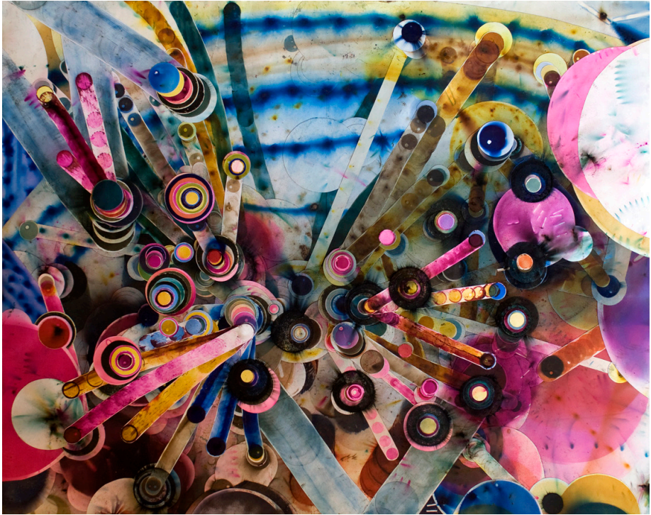
Firework Drawing #7 , Lit color smoke firework residue on paper, collage, 65 \frac{3}{4} x 82 \frac{3}{4} in, 2009