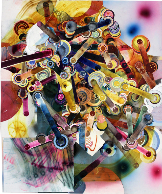
Smoke Painting #35 , Lit color smoke firework residue on paper, collage, 70 ¼ x 59 ¼ in, 2013