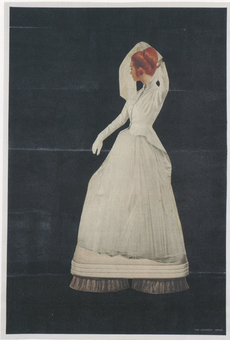
Bride , Hall of Portraits from the History of Machines, 60" x 48", Acrylic painting over printed image on canvas with imprinted pattern from Brawny® paper towels, 2019

Revisionist in method and paradoxically concrete and ephemeral, my work is situated at the intersection of art, science and popular culture. Works combine painting, drawing, printmaking, photography and found objects to create plausible fictions that run both parallel and counter to canonical histories. Projects focus on topics that include cabinets of curiosities and "lost" collections, the picturing of nature and women, and the domestic universe and consumer culture. With the support of the Sam & Adele Golden Foundation Residency, I developed large-scale works for Hall of Portraits from The History of Machines which focuses on objects of desire by proposing an alternate pictorial history that imagines the cultural evolution of the modern female form as conjoined with objects of domestic convenience, efficiency and planned obsolescence.