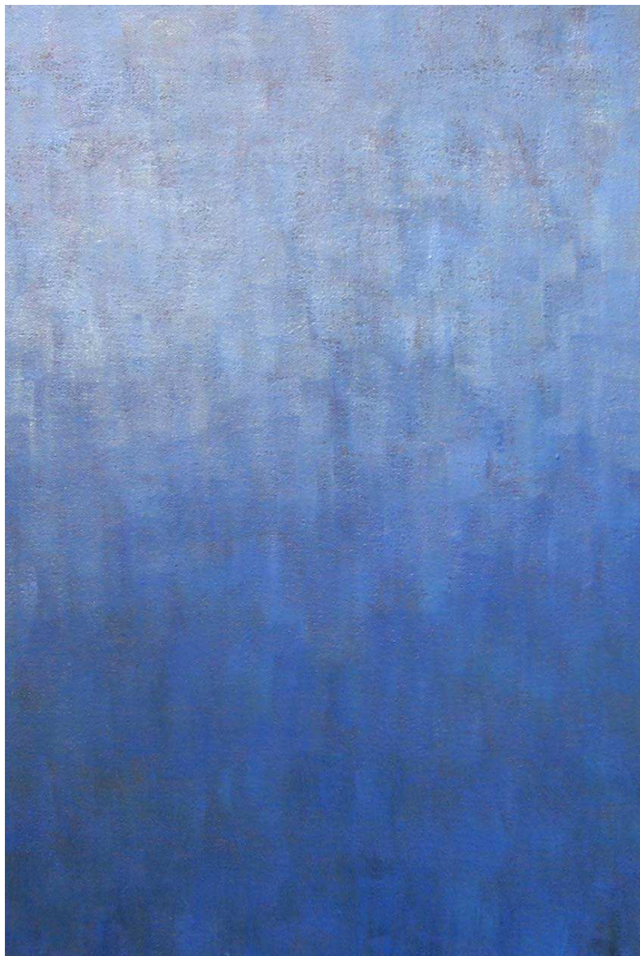
April 4am/4pm, AnnualHours , oil on canvas on alumalite, 16" x 12"