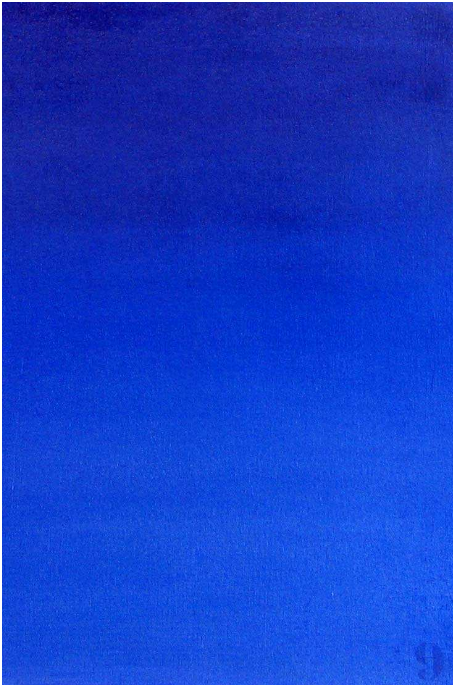
September 9am/9pm, AnnualHours, oil on canvas on alumalite, 16" x 12"