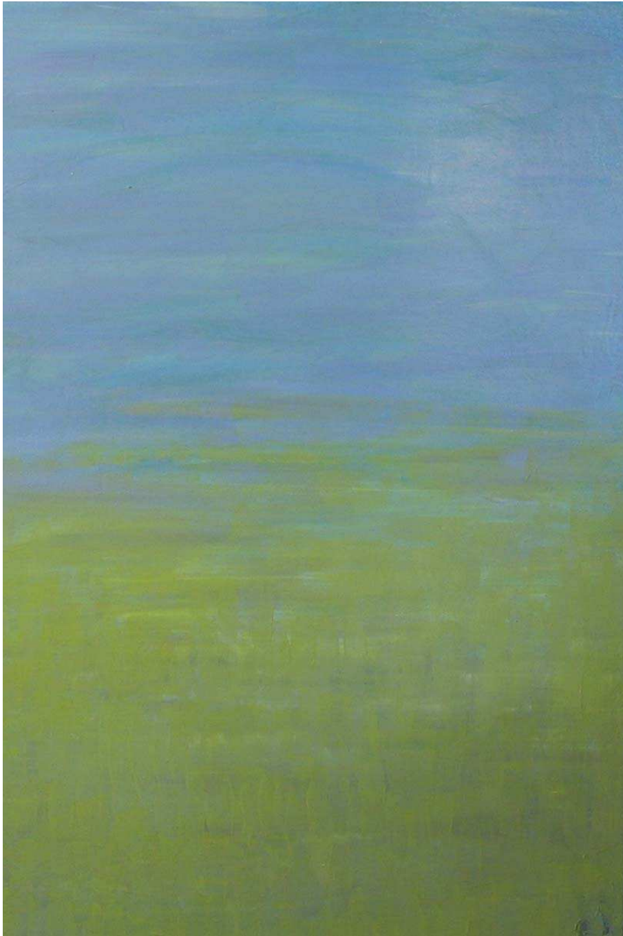
May 5am/5pm, AnnualHours , oil on canvas on alumalite, 16" x 12"