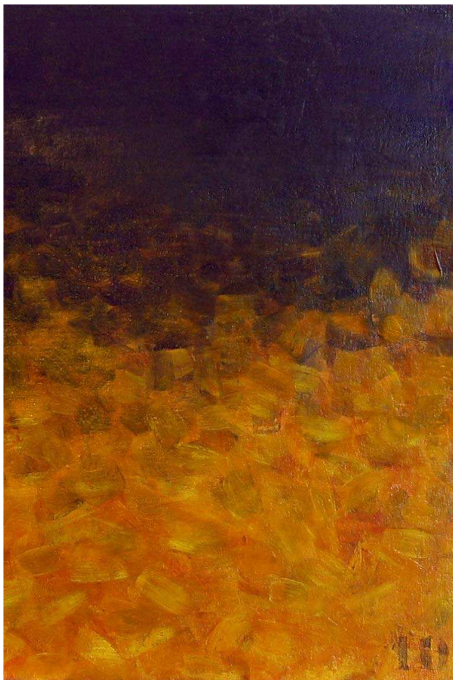
October 10am/10pm, AnnualHours , oil on canvas on alumalite, 16" x 12"