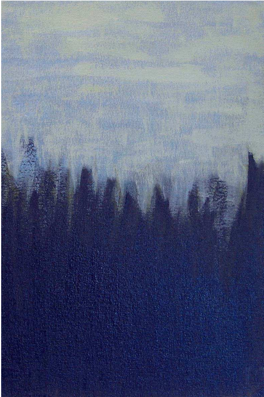
November 11am/11pm, AnnualHours, oil on canvas on alumalite, 16" x 12"