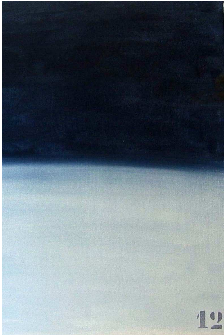
December 12am/12pm, AnnualHours , oil on canvas on aluminite, 16" x 12"