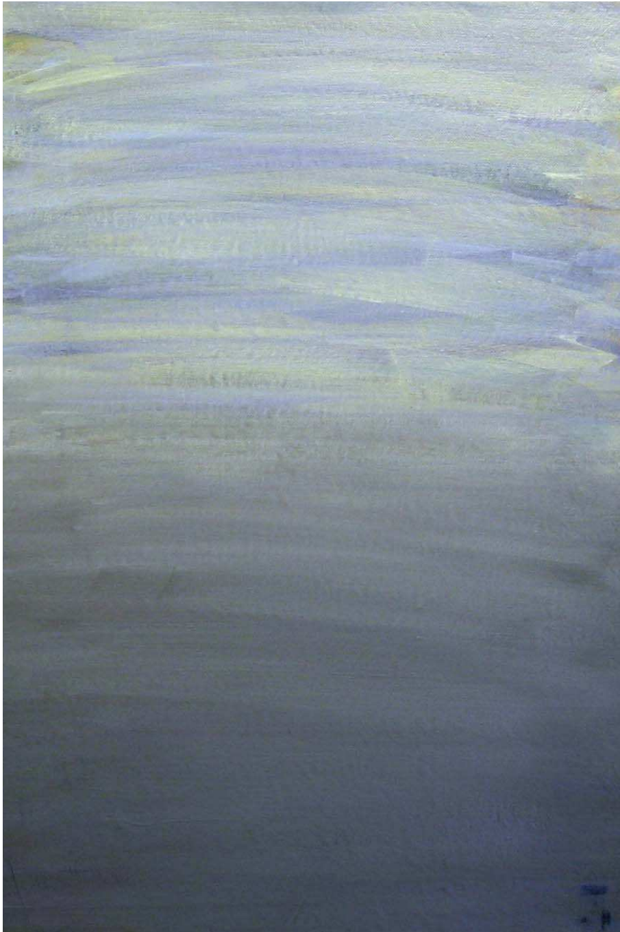
March 3am/3pm, AnnualHours , oil on canvas on alumalite, 16" x 12"