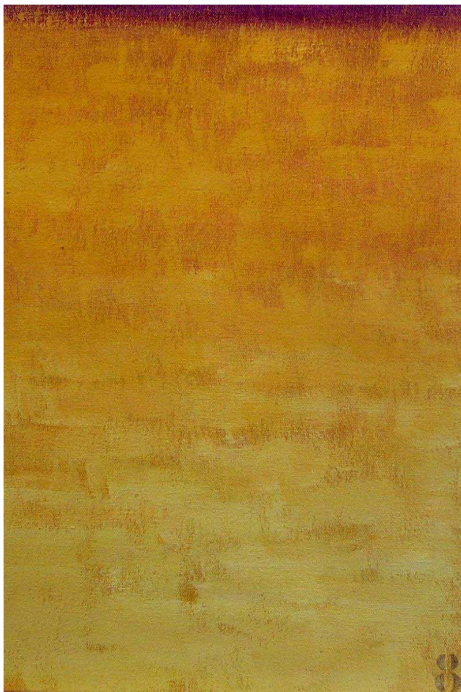
August 8am/8pm, AnnualHours, oil on canvas on alumalite, 16" x 12"