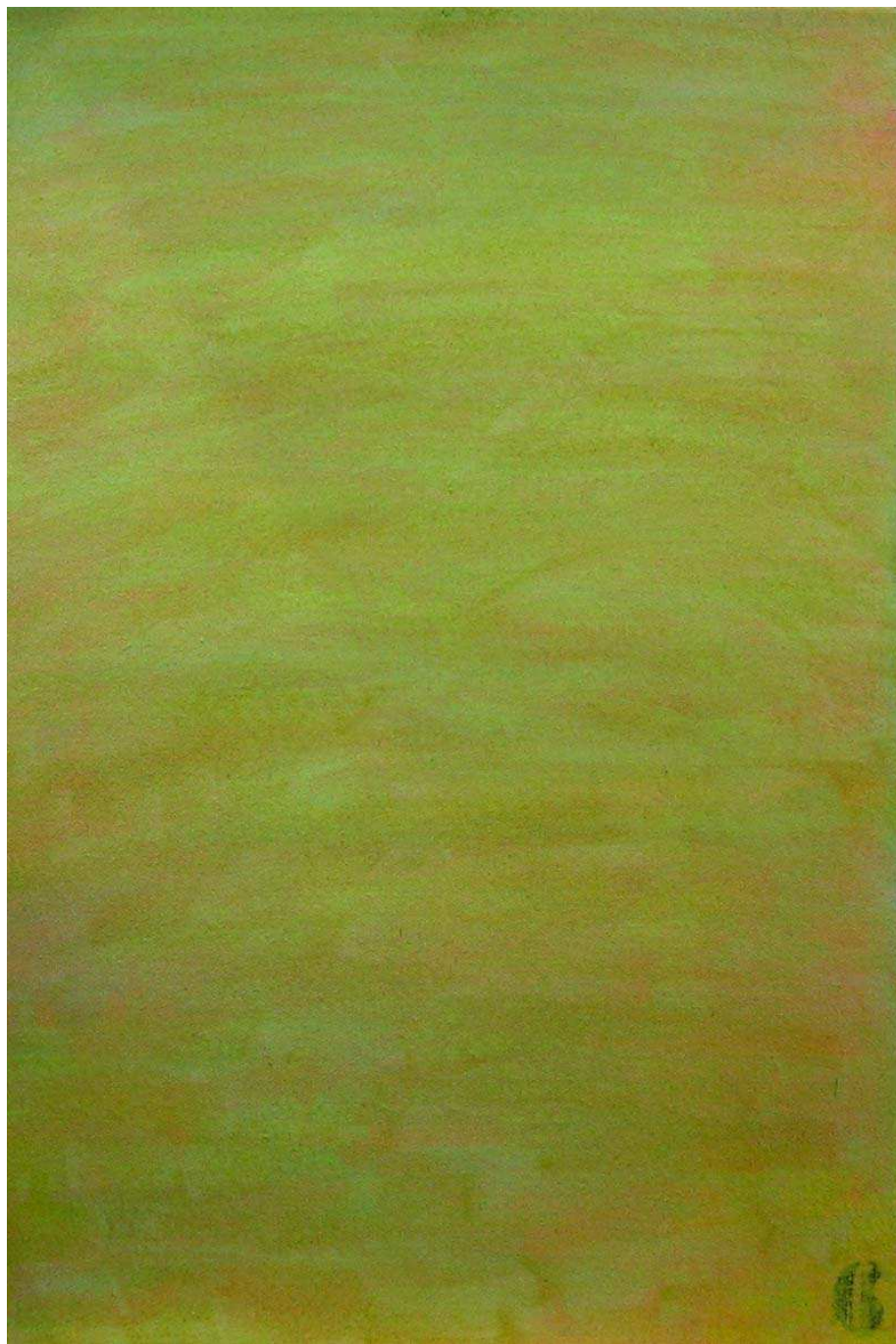
June 6am/6pm, AnnualHours , oil on canvas on alumalite, 16" x 12"