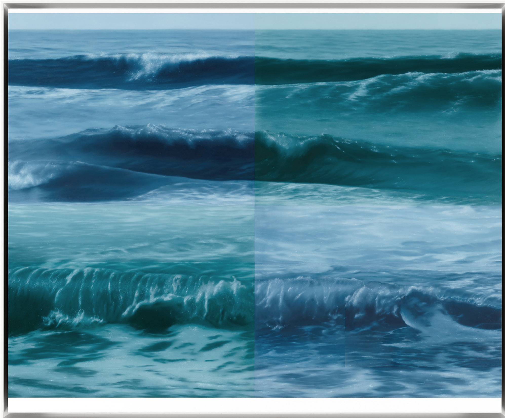
Andrew Sendor Salome and Apollo look to the sea, breathe the salty air and becomes absorbed by the coastal atmosphere 2025 oil on matte white Plexiglas in white powder coated aluminum frame 22 1/2 x 27 1/2 inches // 57 x 70 cm