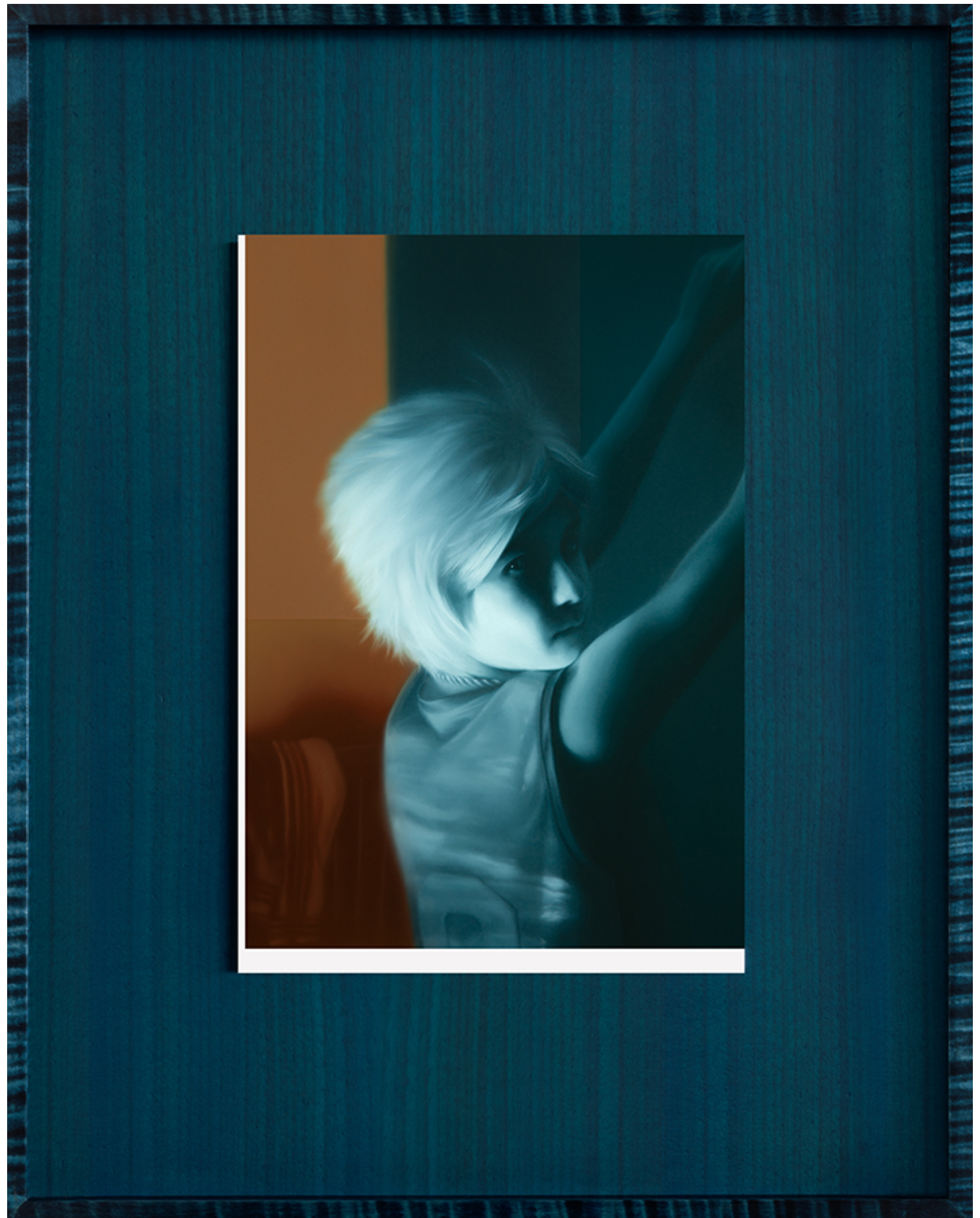
Andrew Sendor Jamir Dunkenshier's Resilience 2025 Oil on matte white plexiglass in tiger maple artist's frame 20 3/4 x 16 1/2 inches (framed) 52.5 x 42 cm (framed)