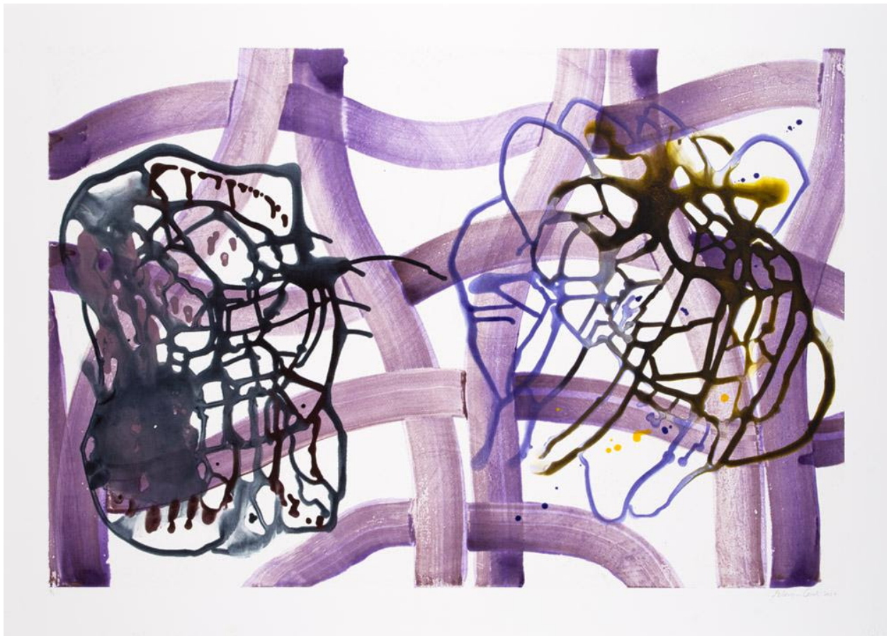
Elisabeth Condon, Intersections 12 , 2024. Watercolor from vellum. 23 3/4 x 35 1/4 inches (image), 28 1/2 x 39 1/2 inches (sheet). $3880, framed.